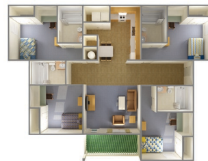
University Pointe - M

C = Cochran Campus E = Eastman Campus M = Macon Campus