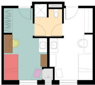
Gateway Hall - C Knights Hall - C Regents Hall - C