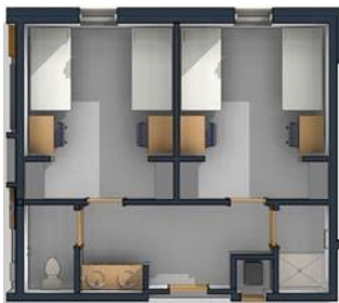
Lakeview Pointe - M