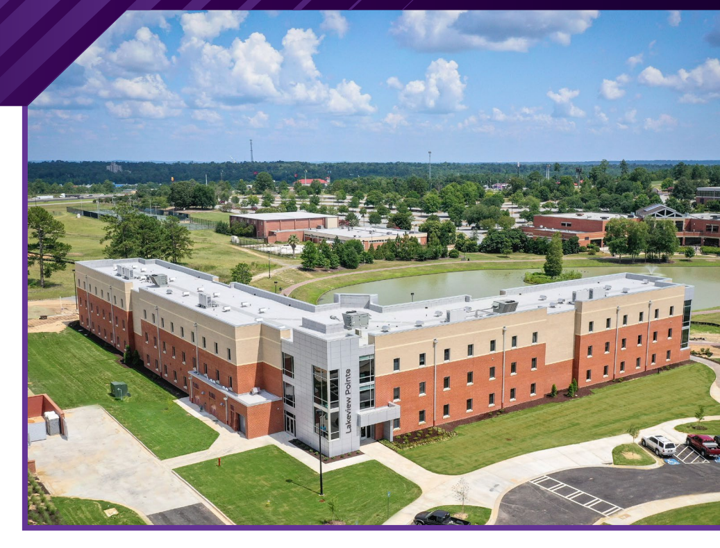
Lakeview Pointe residence hall on the Macon campus

The roads and access project was completed at almost the same time as the construction of Lakeview Pointe, a three-story residence hall that houses 300 students. The $18.5 million project is the first newly built residence hall on MGA's Macon Campus, which opened in 1968 as a small commuter college.