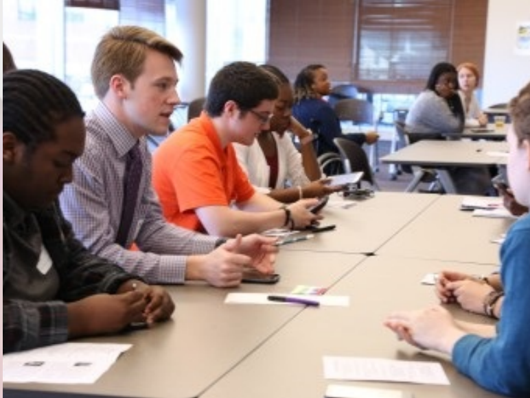
MGA's Diversity Committee completed its 1st academic year of planning initiatives.

Unit Purpose: To guide and coordinate efforts to define, understand, assess, and cultivate diversity and inclusion. The Office also serves as a liaison and collaborative partner to promote diversity, inclusion, and equity as essential elements of the University's values, mission, and strategic plan.